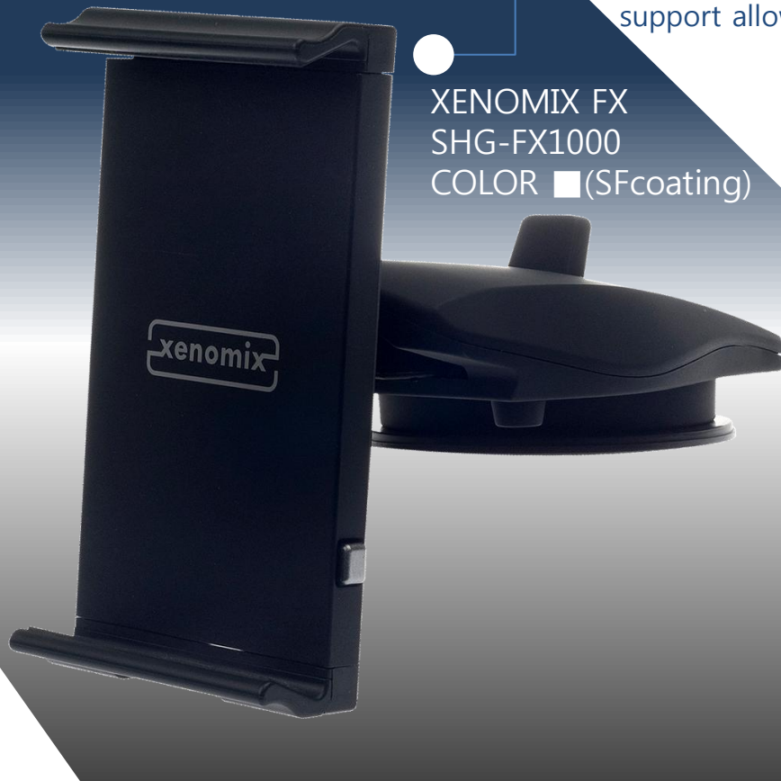
XENOMIX FX SHG-FX1000 COLOR ■(SFcoating)

XENOMIX FX is on-dash type of a holder, which is attached to a dashboard. This product features a luxury design with black and glossless SF coating, easy attachment and detachment, a 360-degree rotating function, an up-and-down Controlling function, and minute angle controlling function for forward-and-backward movement using a one-touch lever. It is a multi-functional holder attached to a dashboard as an adjustable support allowing a navigation tablet PC to be held up on a Smartphone.