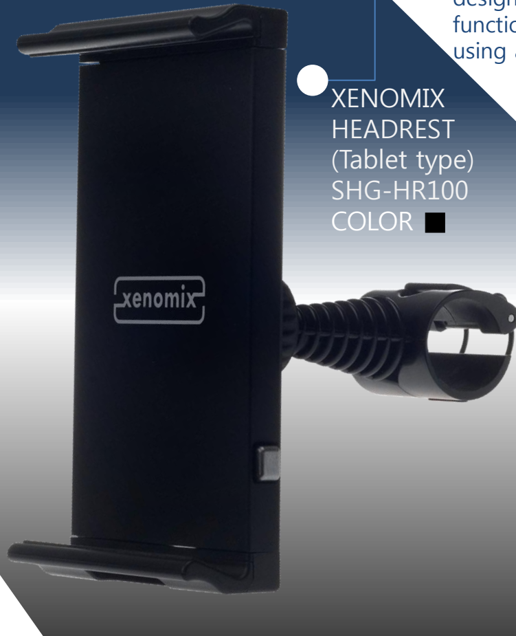
XENOMIX HEADREST (Tablet type) SHG-HR100 COLOR ■

XENOMIX Headrest is designed to enable the user in a back seat to mount a device conveniently using the headrest of vehicles. Mounted adjustable support makes it possible to mount a tablet PC as well as a Smartphone. This product features a luxury design with glossless SF coating, easy attachment and detachment, a 360-degree rotating function, an up-and-down controlling function, and minute angle controlling function using a one-touch lever.