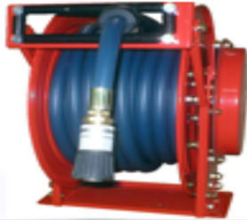
REEL,HOSE REEL : ST'SERIES