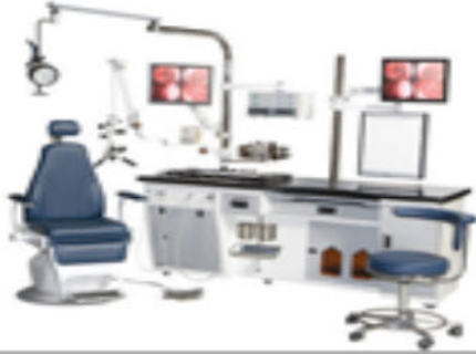
ENT UNIT / CHAIR : INU-6000