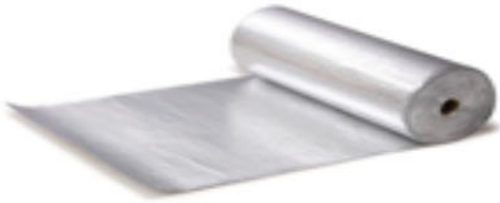
E-Creator(Reflective Insulation) PRIME RB1.7