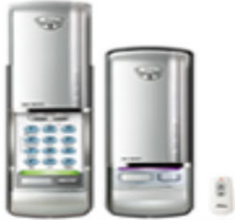
Digital door lock : MI-310R