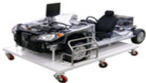
Hybrid LPI engine diagnostic simulator : YESA-3501