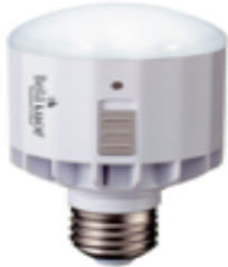
INDI-POWER(LED LAMP) : BL-PT5W