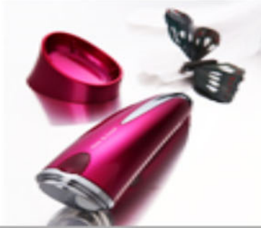
Hot & Cool Ion Massager : UP-2013-02