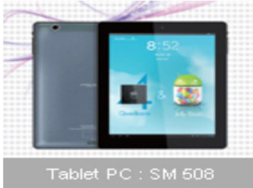
Tablet PC : SM 508