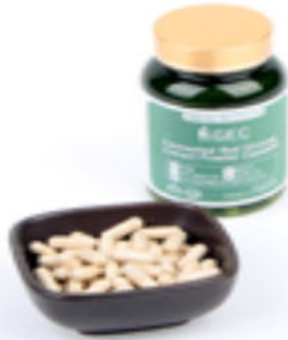
Korean Fermented Red Ginseng Extract Powder Capsule