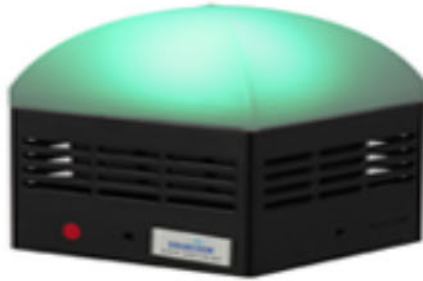
Solar Landscape Lighting SLL-122R, STL-0808