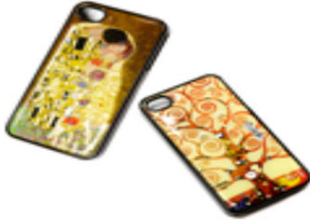
Mobile Phone Case (Mobile Accessory) : MPC