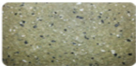
Terra Stone Spray Paint : TR-801