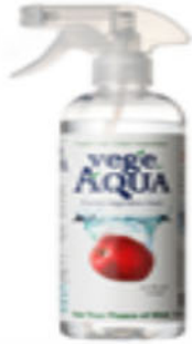
VegeAqua(Fruit and Vegetable washer)