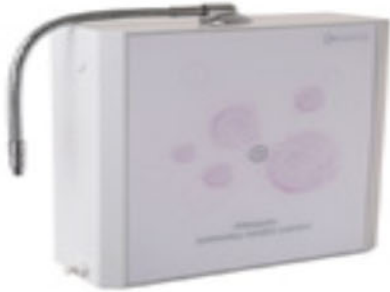
COUNTERTOP WATER PURIFIER HWWT-1000N