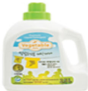
Vegetable Baby: VB-LS25