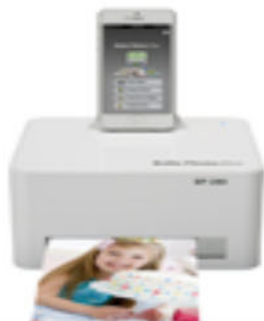
Bolle Photo Plus : BP-280