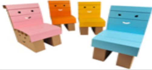
Miley Chair : TKSI_101