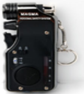
Multi functional Potable security Self-Defense device : MAGMA-W