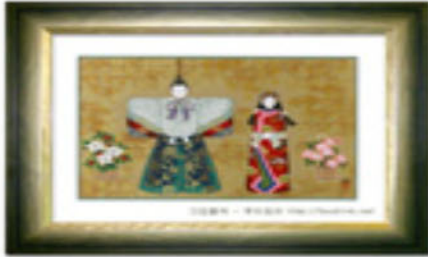
MDF Frame Moulding for picture & photo