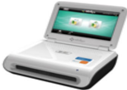
FreeRadicals (MDA) /Urine Analyzer 'BioDoctor' BS-401