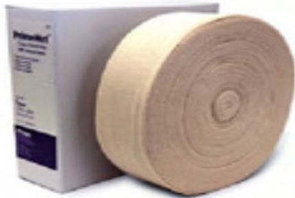
PrimeCast & PrimeSplint & PrimePop Fxx, Pxx, POPxx