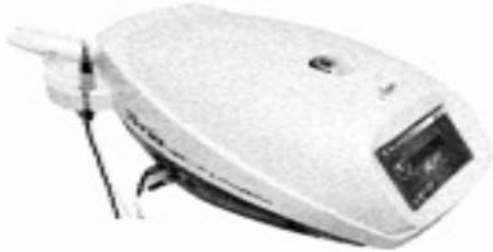
Skin Management System : ARIA