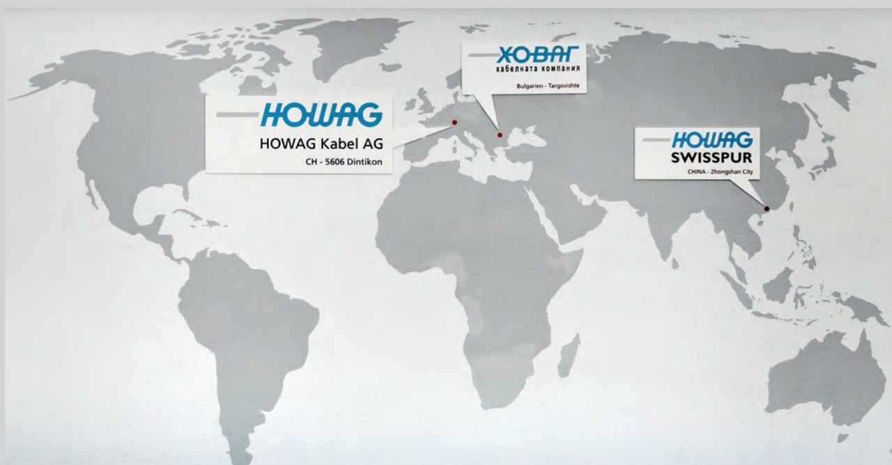
Switzerland, Bulgaria and China: HOWAG Kabel AG has presences with its subsidiaries in Europe and Asia.

Experience and contacts are indispensable for international projects. We are familiar with the stumbling blocks in international partnerships. Our own factories in China and Bulgaria have made us a competent partner who is willing to help at any time.