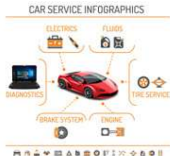
Application: Vehicle Diagnostics