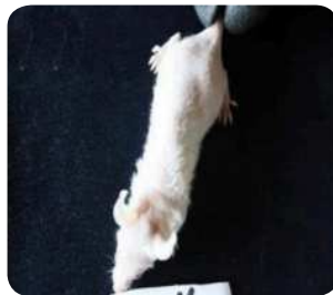
〈 Hairless Mouse Experiment, Animal laboratory in Advanced Radiation Technology Institute 〉