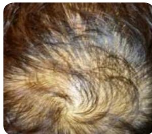
〈 Two weeks after clinical test 〉