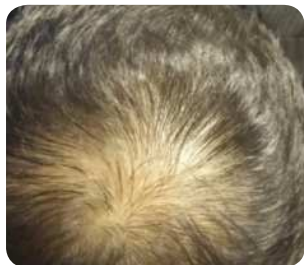
〈 Before clinical test 〉