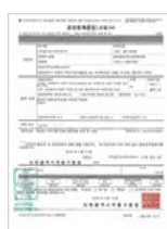
Factory registration card