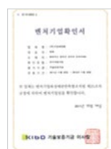
Confirmation of Venture Business