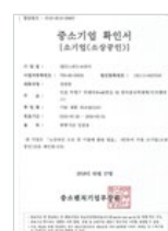
Small and Medium Business Checklist