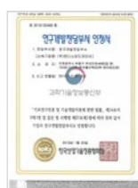
R&D recognition letter