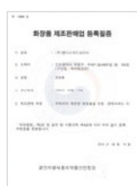
Cosmetics Manufacturing Report Card