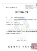
A mail-order business report card