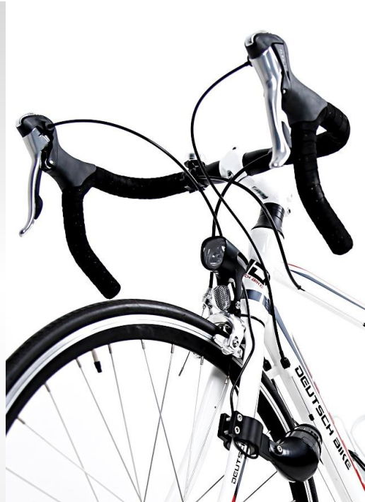
VOLT 1 light