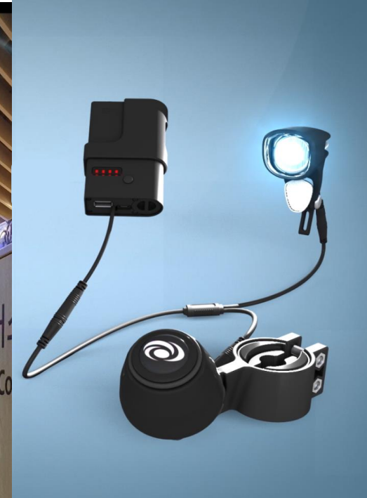
VOLT 1 special