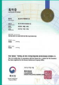
Bicycle Generator & Battery Module