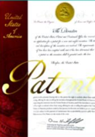
USA - Bicycle Generator