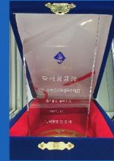
Korea Invention Patent Exhibition 2021