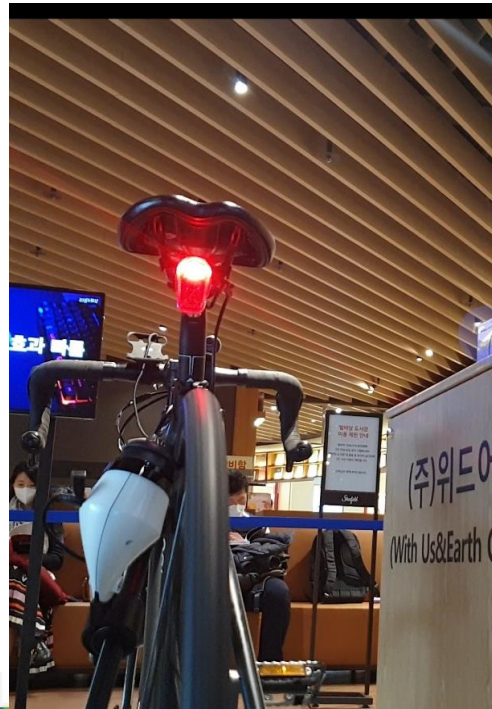
VOLT 1 light2