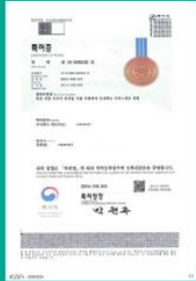
Vehicle location information service