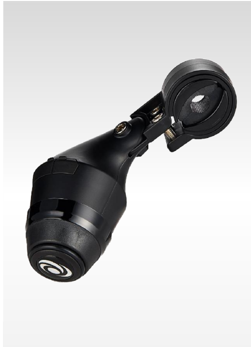
VOLT 1 plus