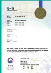
Rotor for generator