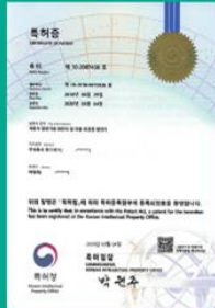
Rotors & generators for generators