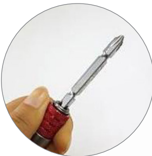
Easy one-touch separation method