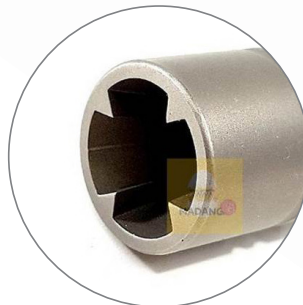
The home holds the wire. Support both forward and reverse directions