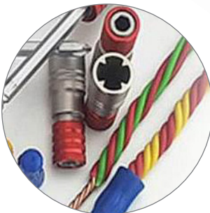
Wire connector available