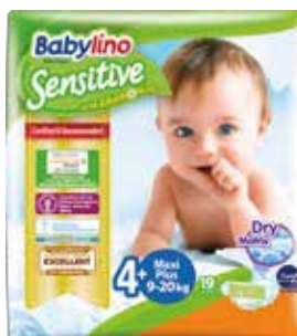
No 4+ Maxi+ 9-20 kg