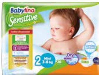
No 2 Mini 3-6 kg