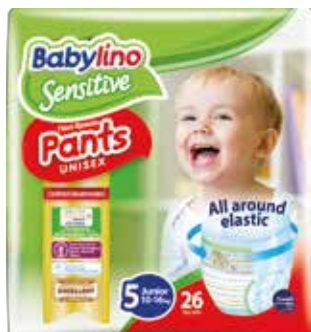
No5 10-16 kg