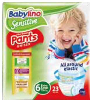
No6 15+ kg