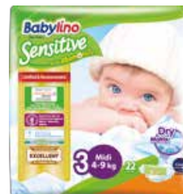
No 3 Midi 4-9 kg