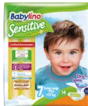
No 7 Extra Large+ 17+ kg