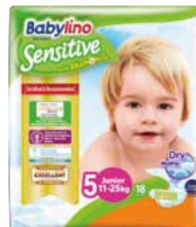
No 5 Junior 11-25 kg