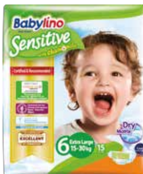
No 6 Extra Large 15-30 kg