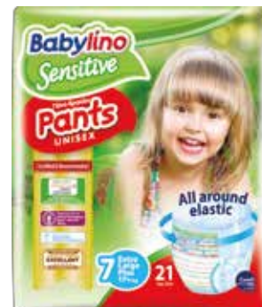
No7 17+ kg