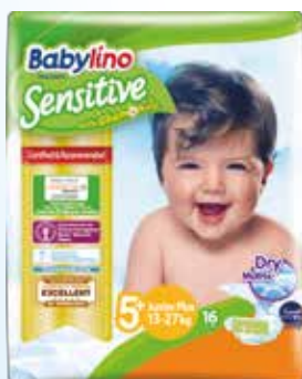
No 5+ Junior+ 13-27 kg