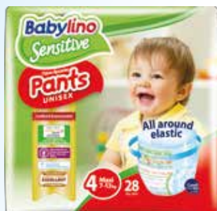
No4 7-13 kg