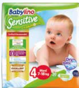
No 4 Maxi 7-18 kg