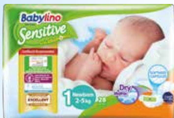
No 1 Newborn 2-5 kg