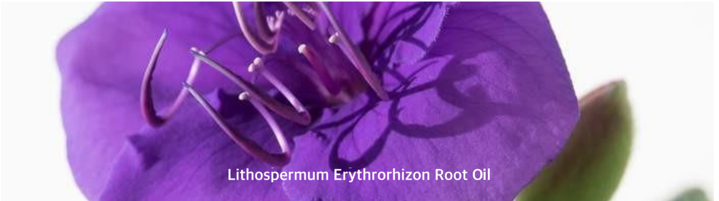
Lithospermum Erythrorhizon Root Oil