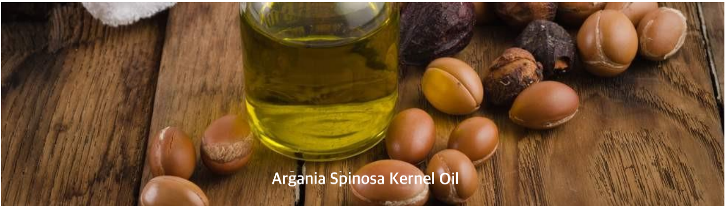
Argania Spinosa Kernel Oil