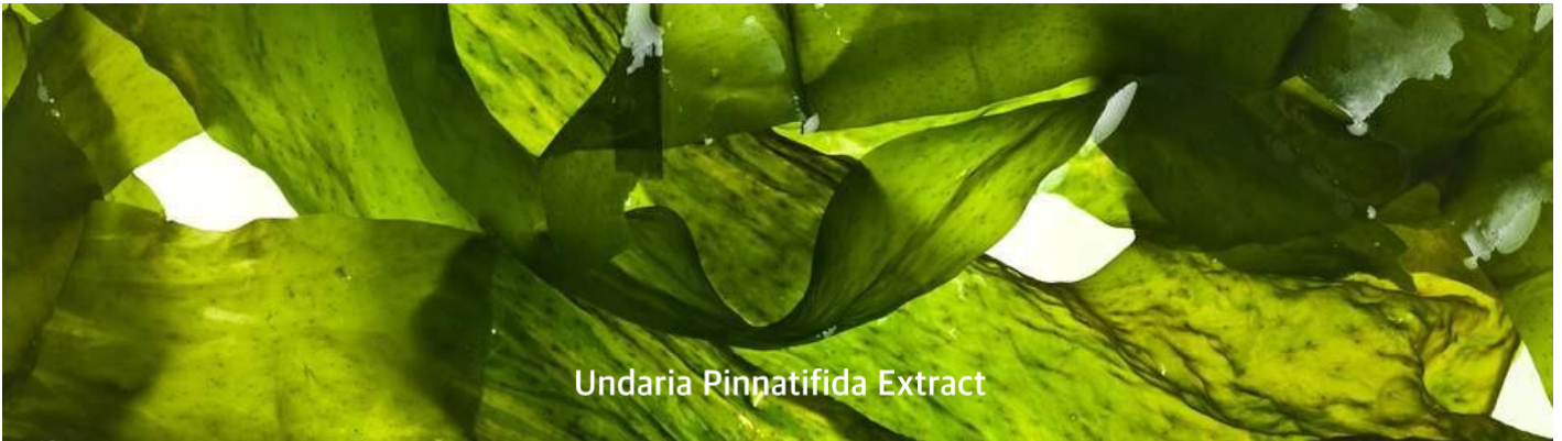
Undaria Pinnatifida Extract