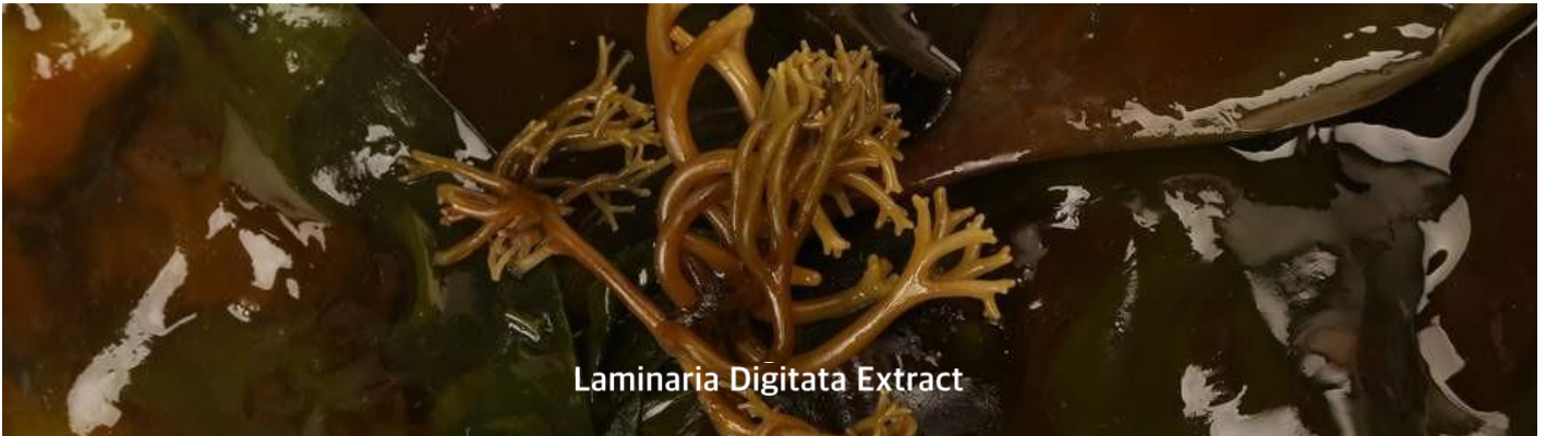
Laminaria Digitata Extract