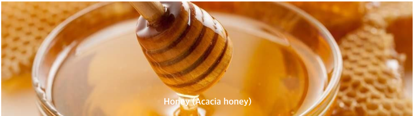
Honey (Acacia honey)