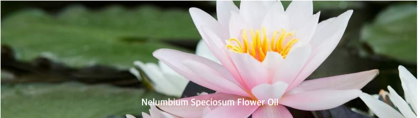
Nelumbium Speciosum Flower Oil