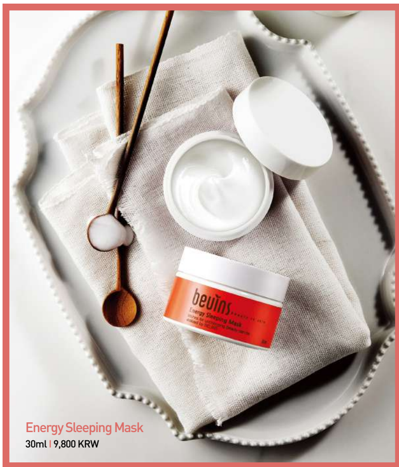
Energy Sleeping Mask 30ml | 9,800 KRW