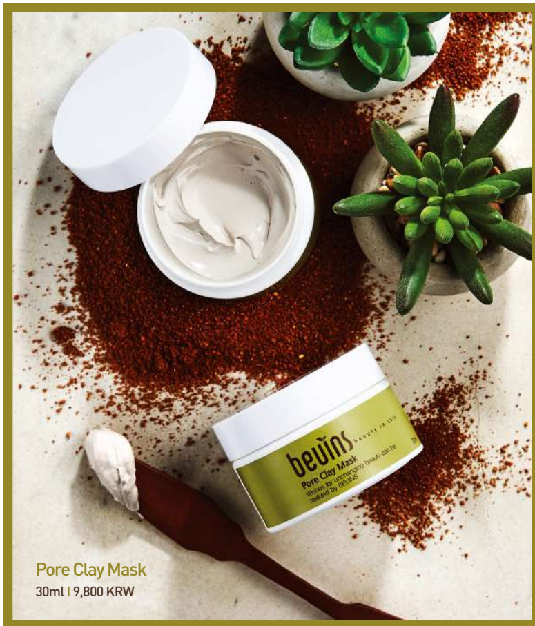
Pore Clay Mask 30ml | 9,800 KRW