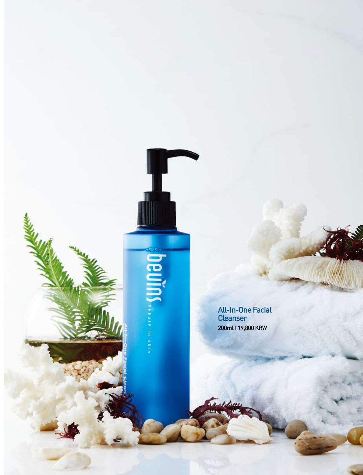
All-In-One Facial Cleanser 200ml | 19,800 KRW

Seaweed such as sea mustard and kelp containing with powerful absorption capacity towards heavy metals help not only remove toxic materials on your skin, but make your skin healthy and flawless with abundant minerals in it. Furthermore as they hydrates dry skin, brown algae extracts are commonly used cosmetic ingredients.