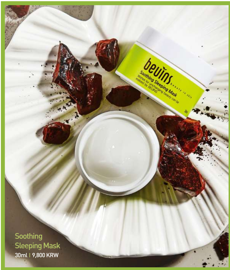
Soothing Sleeping Mask 30ml | 9,800 KRW

Give a rest and nourishment to sensitive skin