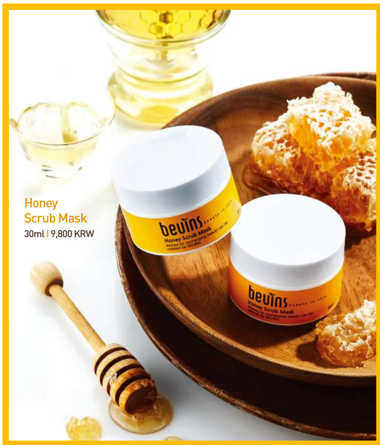
Honey Scrub Mask 30ml | 9,800 KRW

To removes dead skin cells and get healthy glowing skin