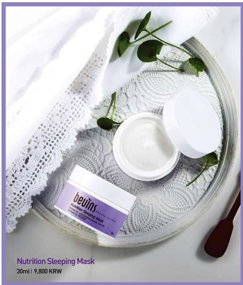
Nutrition Sleeping Mask 30ml | 9,800 KRW

Nourish and revitalize dull and dry skin