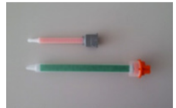
Square 50ml, 250ml