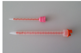
Round 50ml, 250ml