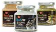
Dongwon spread (230g) (Milk cookie, green tea biscuit, injeolmi peanut) 3 types of unique flavor bring dull dessert alive.