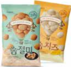
Somjumi/somcheese(40g) Slip melting puff ball (40g) (Sweet rice doughnut, banana) Cute fluffy ball softly melt in a second just like a cotton candy.