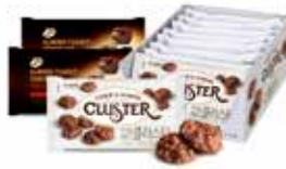
Almond peanut chocolate (80g, 100g) Sweet chocolate mixed with delicious almond and peanut (almond 16%, peanut 16%)