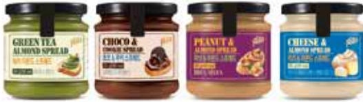
Feliz Spread (250g, 700g) (Green tea almond, choco&cookie, cheese&almond) Typical thick and smooth texture meets crispness.