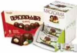
Macadamia chocolat (21g, 64g) Savory macadamia nut in the center of milk chocolate Premium praline type chocolate