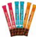
Real choco stick (40g) (Strawberry yoghurt, milk cream, almond) Easy cut and easy bite stick shaped chocolate. Have fun choosing flavors