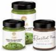
Osulloc green tea/hoji tea spread (200g, 400g) Putting Osulloc green tea and hoji powder creates special recipe