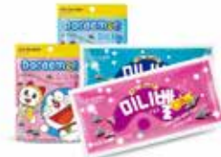
Minibell Children love the crunchiness from the coating candy outside of bell shaped chocolate.