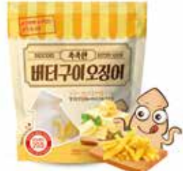
Soft Butter grilled squid (400g) Anyone can enjoy the chewy squid and butter combination