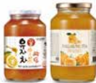
Liquid tea (250g, 400g, 550g, 1kg, 2kg - bottle) High concentration of pulp sorted from handpicked plant. Each ingredient's character was maximized for tasty tea.