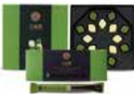
Osulloc Jeju island green tea chocolate (120g, 128g) Osulloc brand green tea chocolate using green tea powder from Jeju island