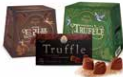
Truffle (200g, 400g) (Milk, green tea) Pleasant moment after one bite of the rich and mouthful real chocolate. Premium cocoa powder on the surface