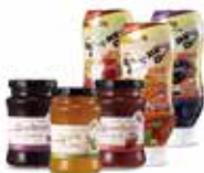
Grache jam (250g, 400g-bottle, 550g-tube) (Strawberry, apple, blueberry) See the vibrant pulp of natural fruit in a transparent jar. European preserved style jam