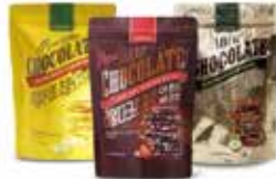
Real chocolate barkthin(260g) (Dark almond, white banana, milk hazelnut mocha) No determinate form, Break as you like. High percentage of dried nuts coated with chocolate