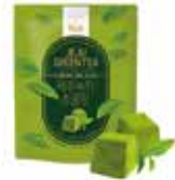
Jeju green tea chocolate (250g) Soft green tea chocolate rolled in green tea powder cultivated in clean Jeju area