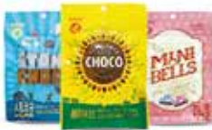
Minibell, stone choco, sunflower seed choco (100g, 80g, 80g) Three concepts of "Nobrand" private products