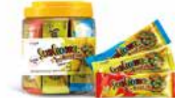
Sunflower seed choco ball Safely made sunflower seed chocolate with natural edible color