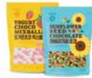
Sunflower seed chocoball Sunflower seed covered in colorful chocolate Yoghurt mixball (200g, 160g) Yoghurt powder inside of delicious chocolate