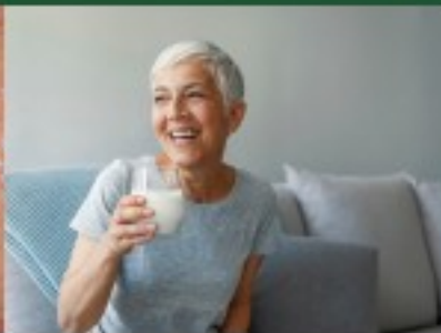
Help with women's menopause