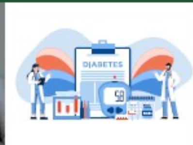
Help with diabetes