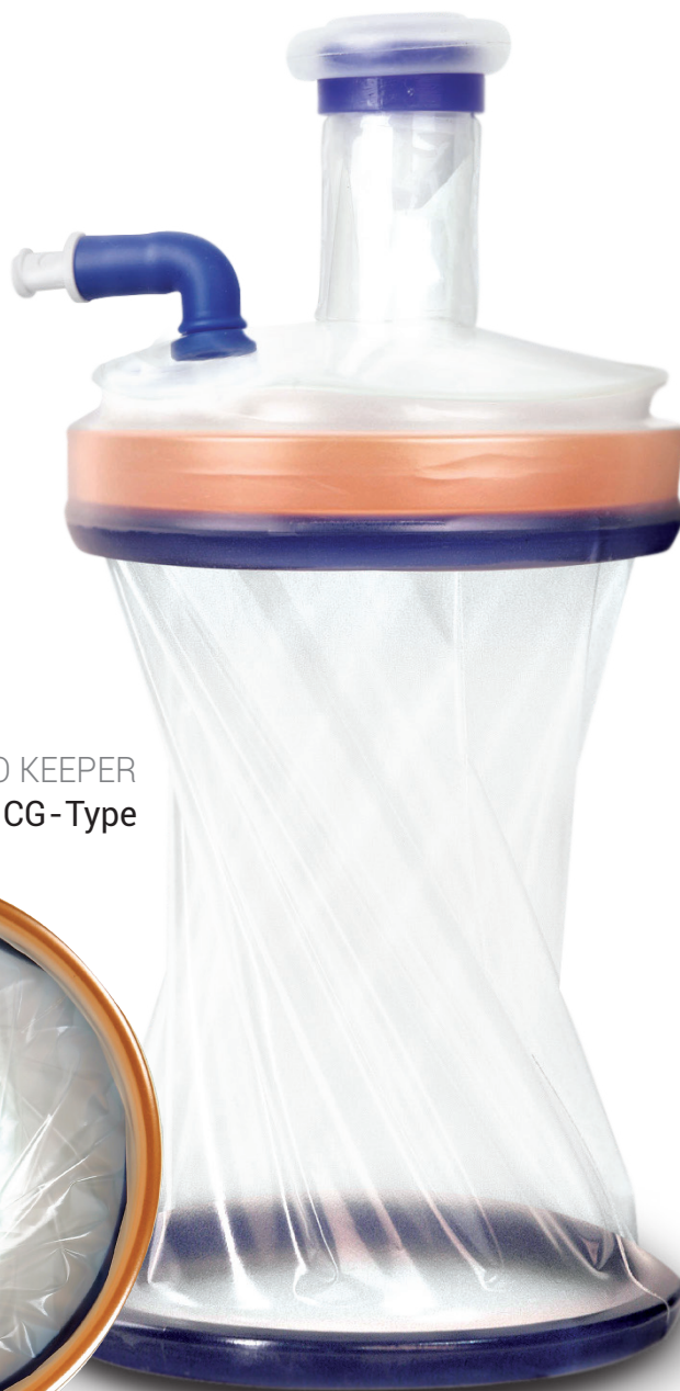
ENDO KEEPER CG-Type

Easy to convert laparoscopy to open surgery