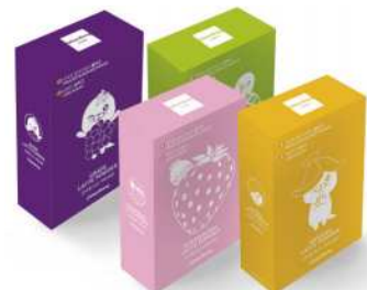
⑨ Sweet beverage powder for KID