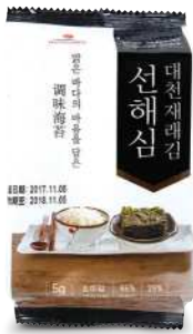
① CRISPY Sea Snack Korean original flavor