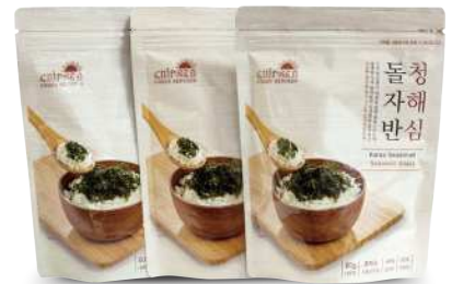
⑥ CRISPY fried Sea Snack for RICEBALL