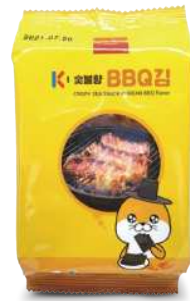
③ CRISPY Sea Snack Korean BBQ flavor