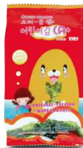
⑤ CRISPY Sea Snack Olive oil flavor for KID CA+