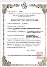
Export fisheries products processing registration.- Target : China