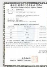
Country of origin certificate exporter by item Certificate