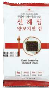
② CRISPY Sea Snack with Cumin flavor