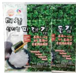
⑧ CRISPY Big size Sea Snack Korean original flavor