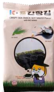
⑦ CRISPY Soy sauce sea snack with sprouted oats