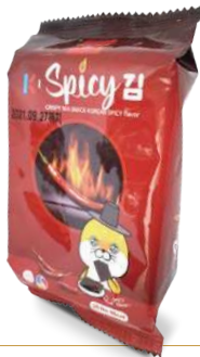
④ CRISPY Sea Snack Korean SPICY flavor