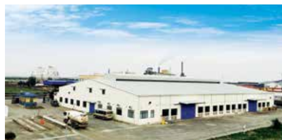
Maxsun(Hai Phong) Co., Ltd.