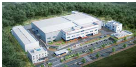
GS Chem Co., Ltd.