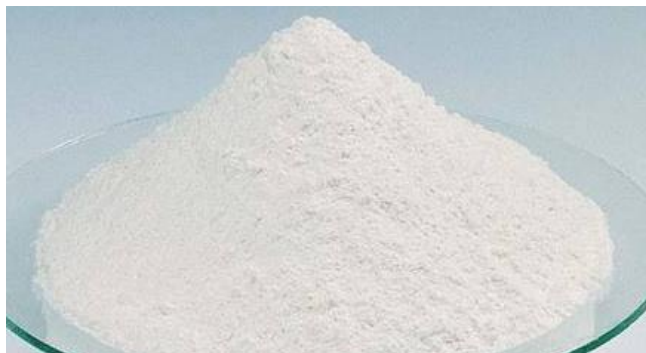
Calcined Kaolin Powder

Being a well-reckoned Manufacturer, Exporter & Supplier, we are making available qualitative and cost effective Calcined Kaolin Powder in the global market. The advanced and modern processing techniques ensure consistent quality, low specific gravity, good whiteness and freedom from impurities at pocket friendly costs. We make due consideration on its packaging so that moisture free content reaches the buyers.