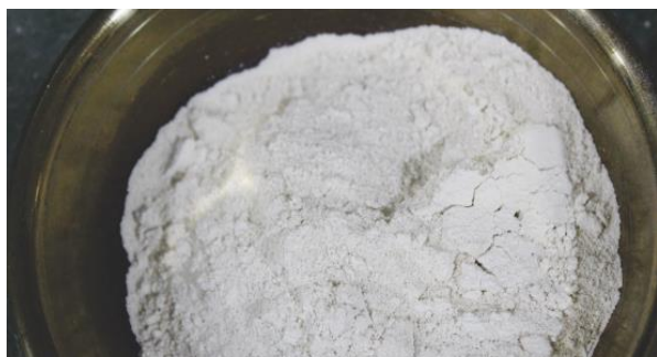
Hydrous Kaolin Powder

Balaji Minechem has micronized plant to produce very fine powder. Hydrous China clay is used as extender and additives in the coatings. It is also used in plastic, rubber, wire, cable, paint, paper and ceramic industries. It has light weight and low bulk density. It has low microns and particle size distributors. Mainly, it is widely used as filler. Balaji Minechem manufactures all the above grades and also customized products as per customer's specification.