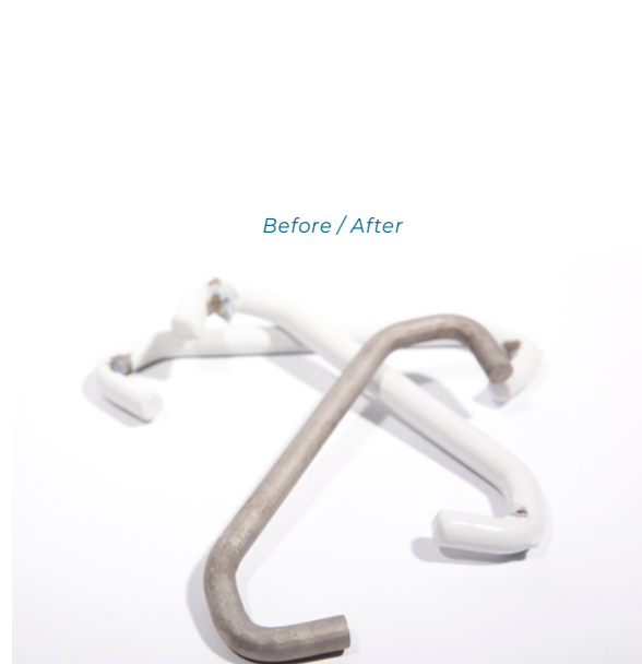
Before / After