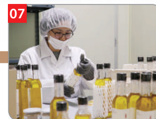
Visual inspection (checking impurities)