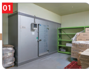
Receiving and storing of raw ingredients (low-temperature storage)