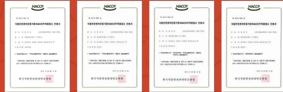
Certification of HACCP