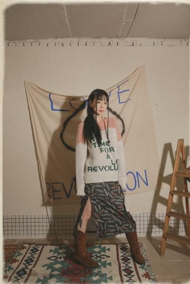
high school disco