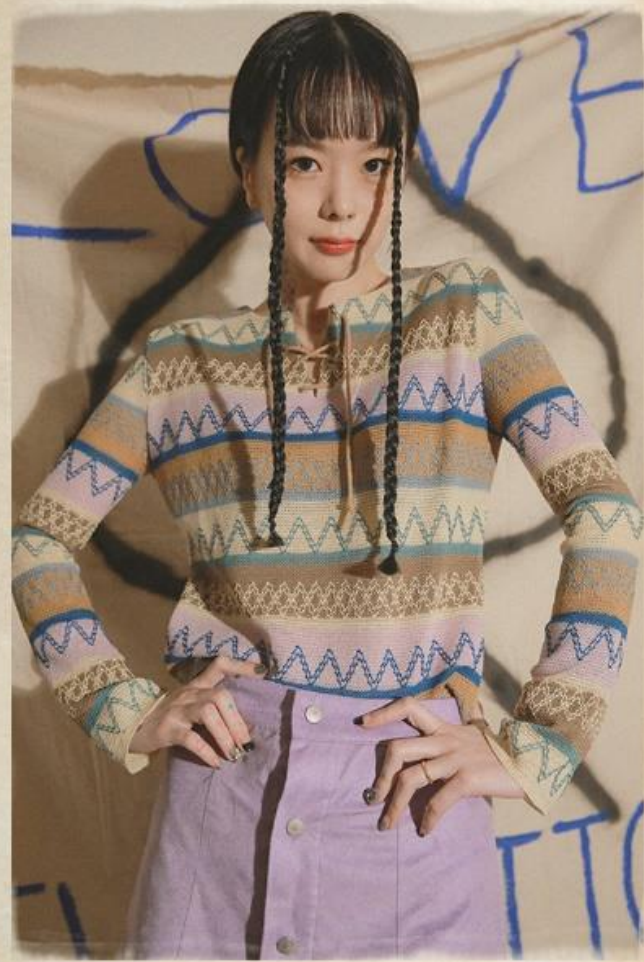
high school disco