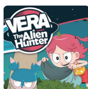
Mobile App (See page 10)