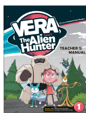
Digital Teacher's Manual