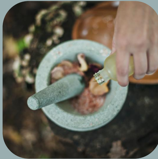
[Raw Materials for Cosmetics]