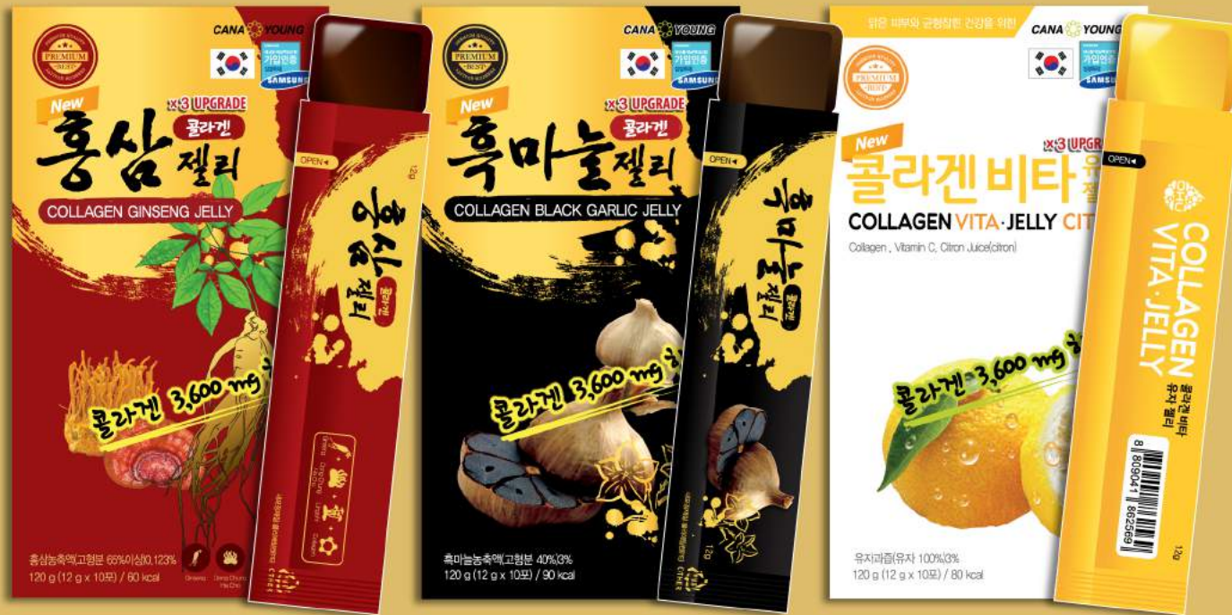
NEW Collagen Red Ginseng Jelly