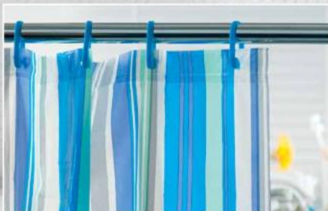
Home Textile and Other