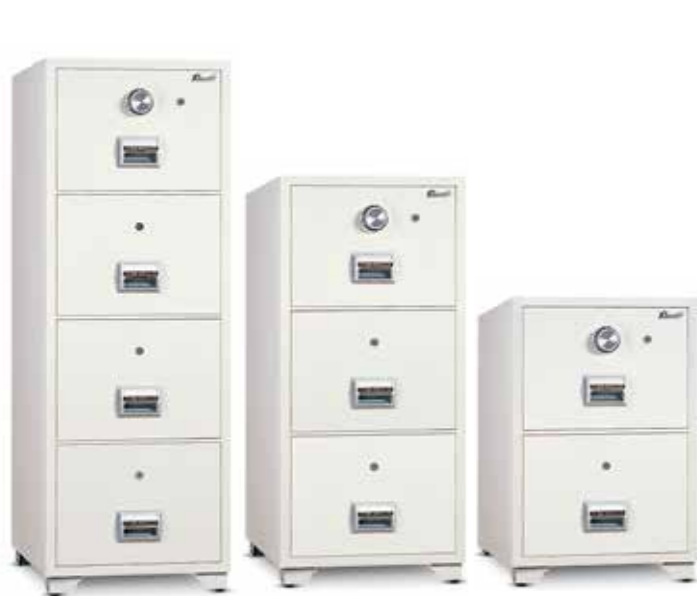
BIF-400 BIF-300 BIF-200