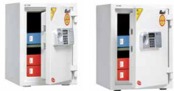
BS-T500 DIGITAL BS-T530W DIGITAL