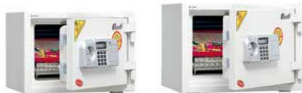
BS-T310 DIGITAL BS-T360 DIGITAL