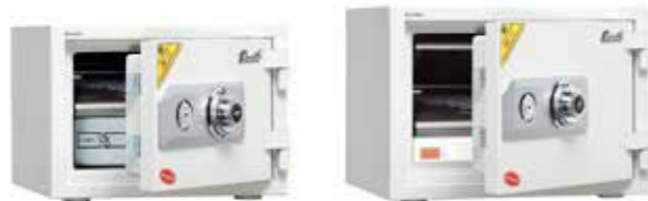
BS-D310 DIAL BS-D360 DIAL