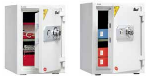
BS-D500 DIAL BS-D530W DIAL