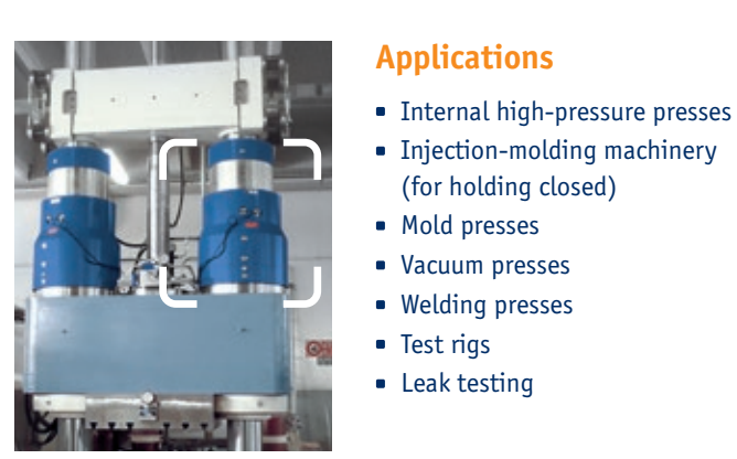
Injection-molding machinery (for holding closed)