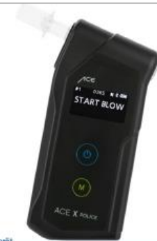
Tabelle 4: Zusammenfassung der Ergebnisse für das ACE X Police Atemalkohol-Messgerät.