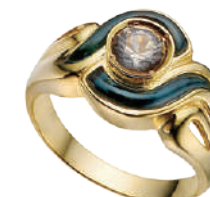
EAR - 2007