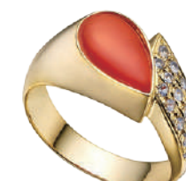
EAR - 2008