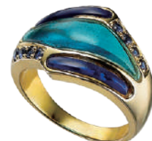
DJR - 2014