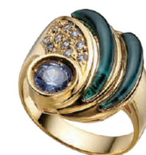
EAR - 2005