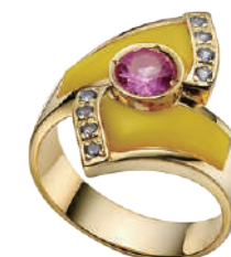
EAR - 2003