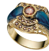
EAR - 2004