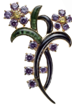
DJB - 3