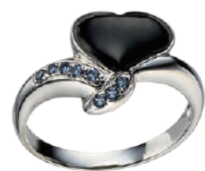
DJR - 1098