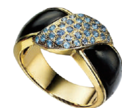
DJR - 2031