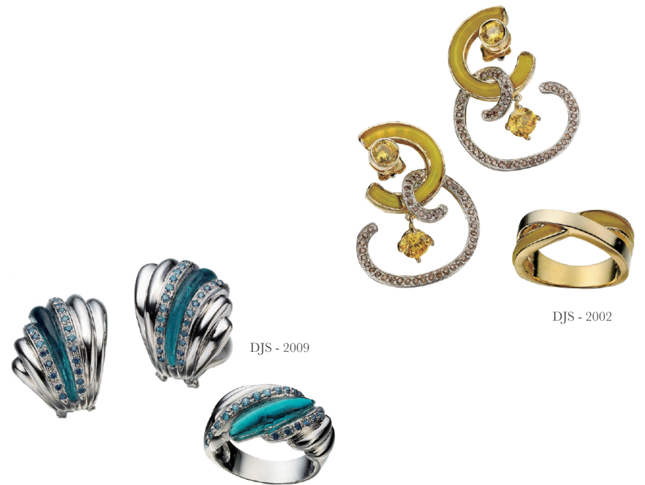
DJS - 2002