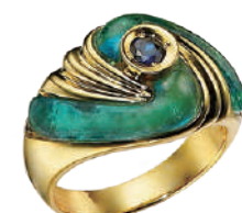
DJR - 2028