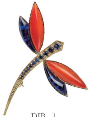
DJB - 1