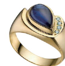
EAR - 2009