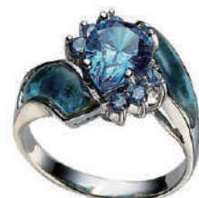
DJR - 2011