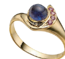
EAR - 2006