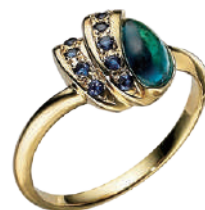
DJR - 1099