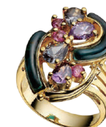
EAR - 2013