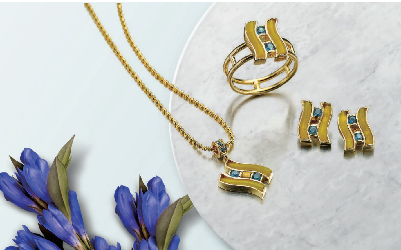
DJS - 2007