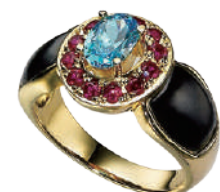
DJR - 2017