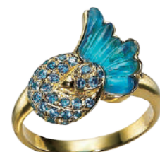
DJR - 2020