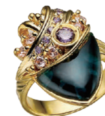
EAR - 2012