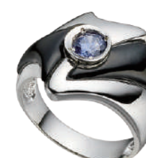
EAR - 2011