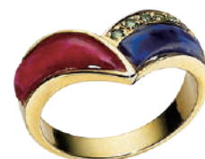
DJR - 2023