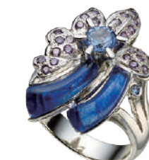
EAR - 2010