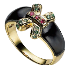
DJR - 2021