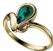
DJR - 2032