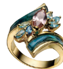
EAR - 2001