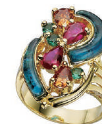
EAR - 2016