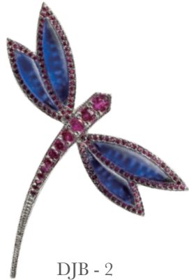
DJB - 2