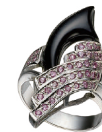
EAR - 2017