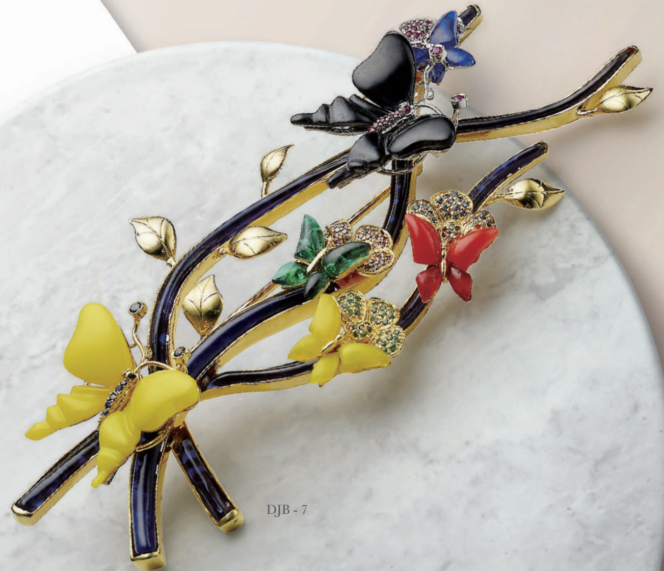
DJB - 7

A GEM THAT SHINES WITH HIGH QUALITY AND PROFOUND FEELING. THE MINERITE STONE WHICH CARRIES THE COLOR OF NATURE. TELLS YOU DIGNITY IN YOUR HEART.