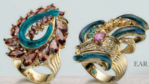
EAR - 2014 / EAR - 2015

THE LIGHT OF THE BEAUTIFUL MINERITE STONE MAKES HER ELEGANCE EVEN BRIGHTER. A HARMONY OF NATURE'S BRILLIANT LIGHT AND LUXURIOUS DESIGN.