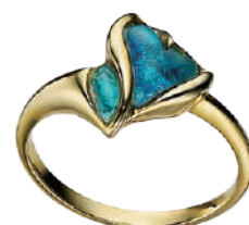
DJR - 2029