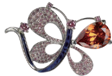
DJB - 4