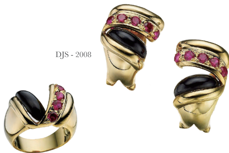
DJS - 2008

Elegant space where other people's eyes are focused a woman of dignity and intelligence. In the midst of dignity, shining jewels.