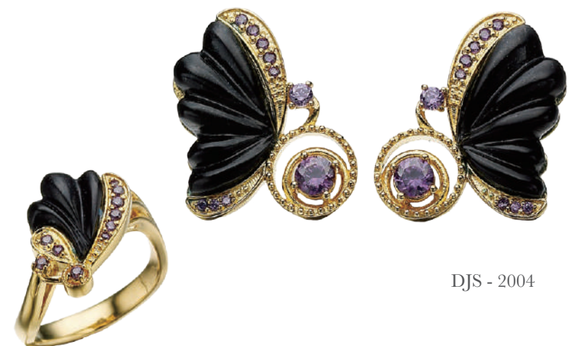
DJS - 2004