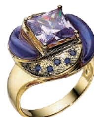
DJR - 2019