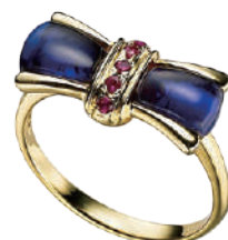
DJR - 2027