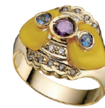
EAR - 2002