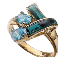
DJR - 2033

Beauty with Nature A mild yet luxurious harmony She falls into it.