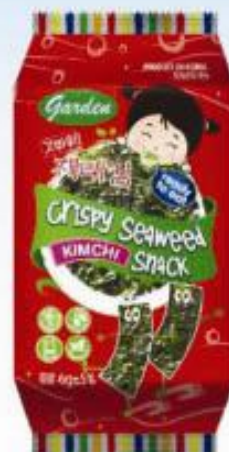
Roasted Seaweed with KIMCHI FLAVOR

INGREDIENTS Seaweed, Olive Oil, Sweet Corn Oil, Sea Salt, Sesame Oil