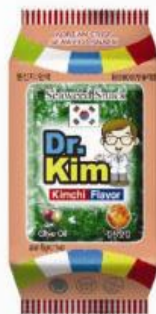
Roasted Seaweed with KIMCHI FLAVOR

INGREDIENTS Seaweed, Olive Oil, Sweet Corn Oil, Sea Salt, Sesame Oil