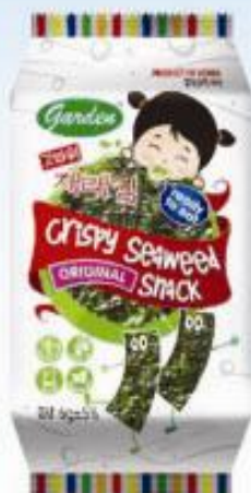
Roasted Seaweed with ORIGINAL

"GODBAWEE seaweed snack is a way to treat yourself to a healthy and delicious snack."