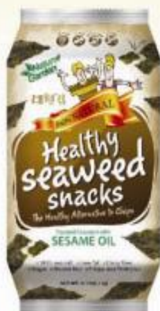
Roasted Seaweed with SESAME OIL

"GODBAWEE seaweed snack is a way to treat yourself to a healthy and delicious snack."