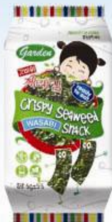
Roasted Seaweed with WASABI POWDER