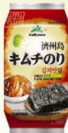
Roasted Seaweed with KIMCHI FLAVOR

INGREDIENTS Seaweed, Olive Oil, Sweet Corn Oil, Sea Salt, Sesame Oil