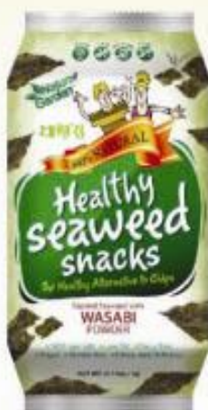
Roasted Seaweed with WASABI POWDER