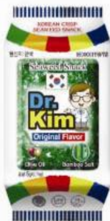
Roasted Seaweed with ORIGINAL

"GODBAWEE seaweed snack is a way to treat yourself to a healthy and delicious snack."