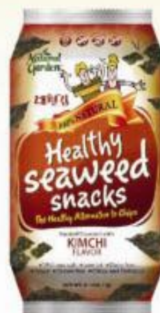
Roasted Seaweed with KIMCHI FLAVOR

INGREDIENTS Seaweed, Olive Oil, Sweet Corn Oil, Sea Salt, Sesame Oil