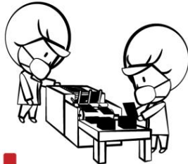
Foreign substance removal