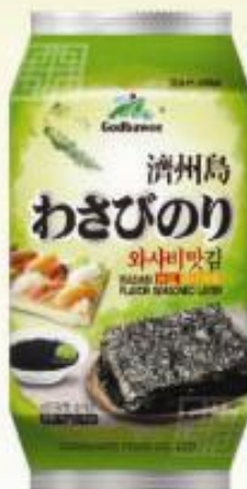
Roasted Seaweed with WASABI POWDER