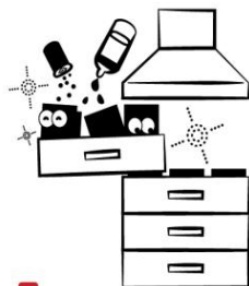
Baking and seasoning