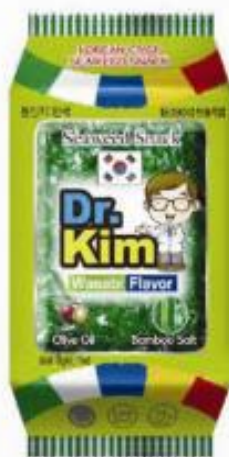
Roasted Seaweed with WASABI POWDER