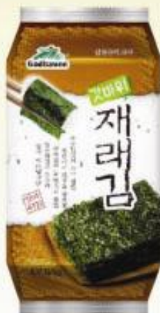
Roasted Seaweed with ORIGINAL

"GODBAWEE seaweed snack is a way to treat yourself to a healthy and delicious snack."