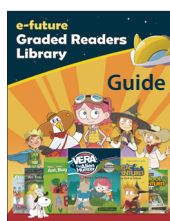
Extensive Reading Guide (Digital)