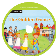
Audio CD Level 2.21 - Level 6