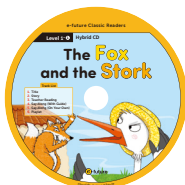
Hybrid CD Starter - Level 2.20