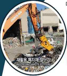
재활용 폐자재 절단기 RECYCLING WASTE CUTTER