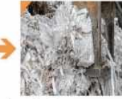
Roll Burlap bag Cutting