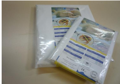
DUST MITE COVERS