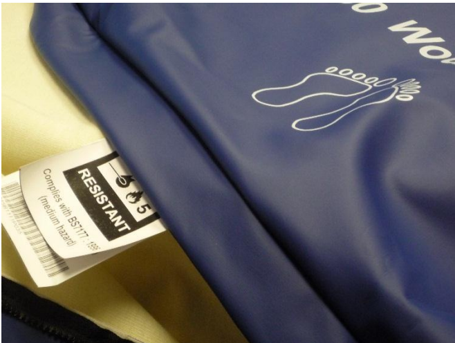
MATTRESS & CUSHION COVERS - WELDED (Ultrasonic and High Frequency) or STITCHED