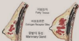
Amie-sIII Volume up lifting Cream