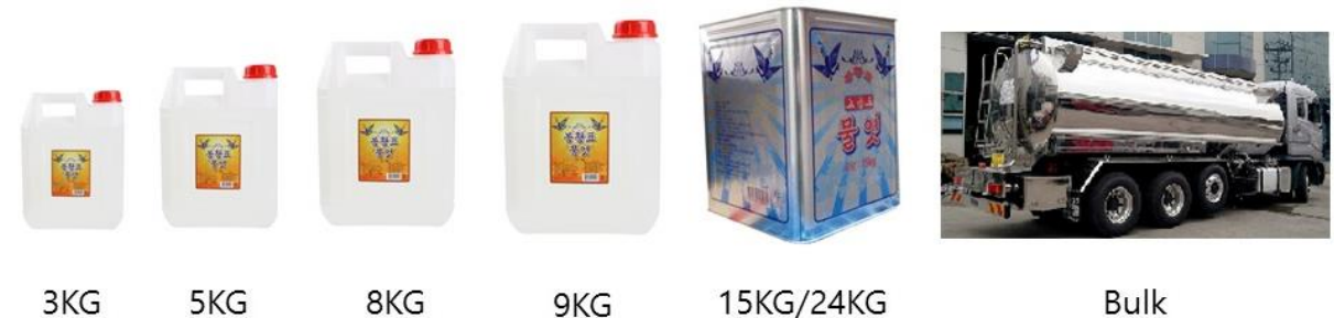
3KG 5KG 8KG 9KG 15KG/24KG Bulk