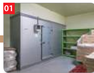
Receiving and storing of raw ingredients (low-temperature storage)