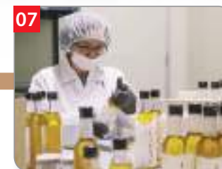
Visual inspection (checking impurities)